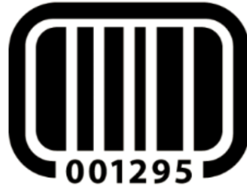
BARCODE BASED POS FOR FAST BILLING