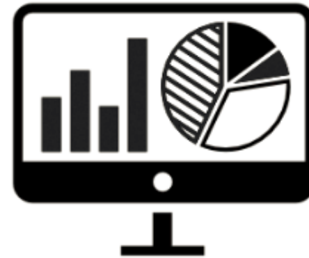
ANALYSIS REPORTS WITH PIVOT & GRAPHS