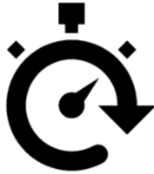
EASE OF USE AND FASTER FAMILIARIZATION