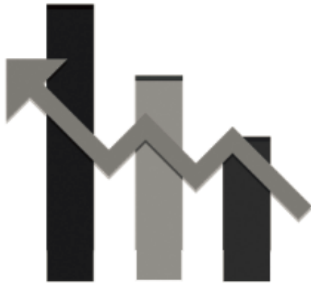
MONITOR INVENTORY STOCK LEVELS