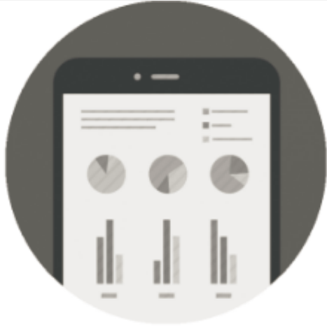
RUN BUSINESS ON THE GO USING SMART PHONE